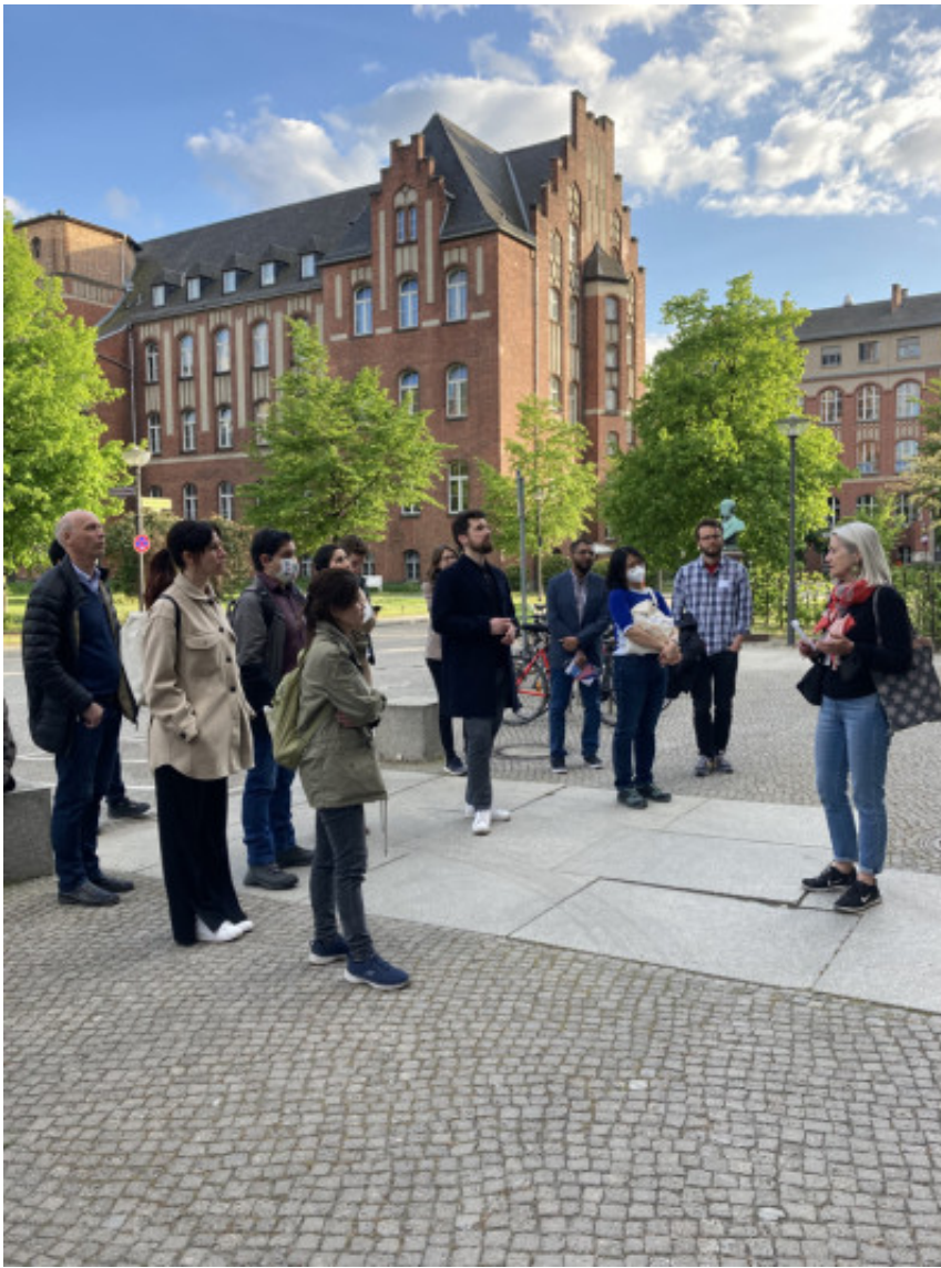
Guided tour of Charité

Universitätsmedizin.