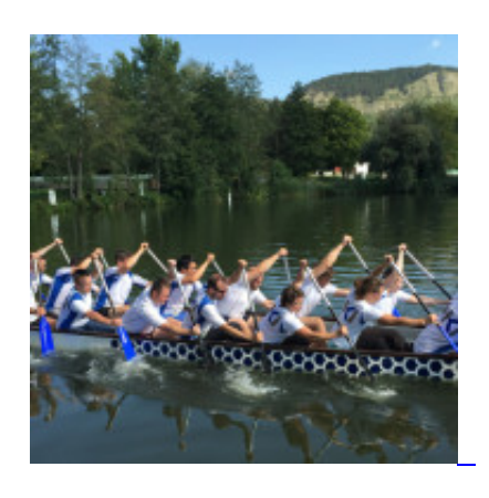
September 12, 2015