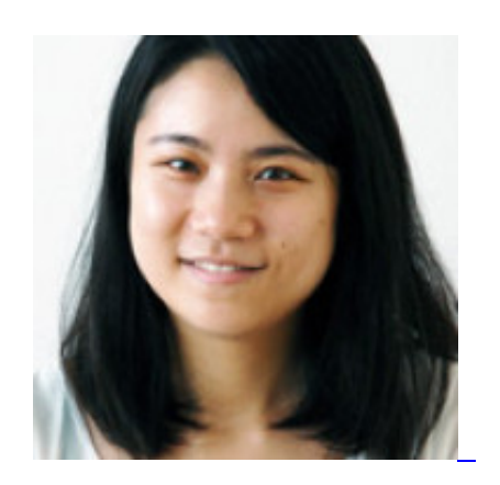
September 12, 2015